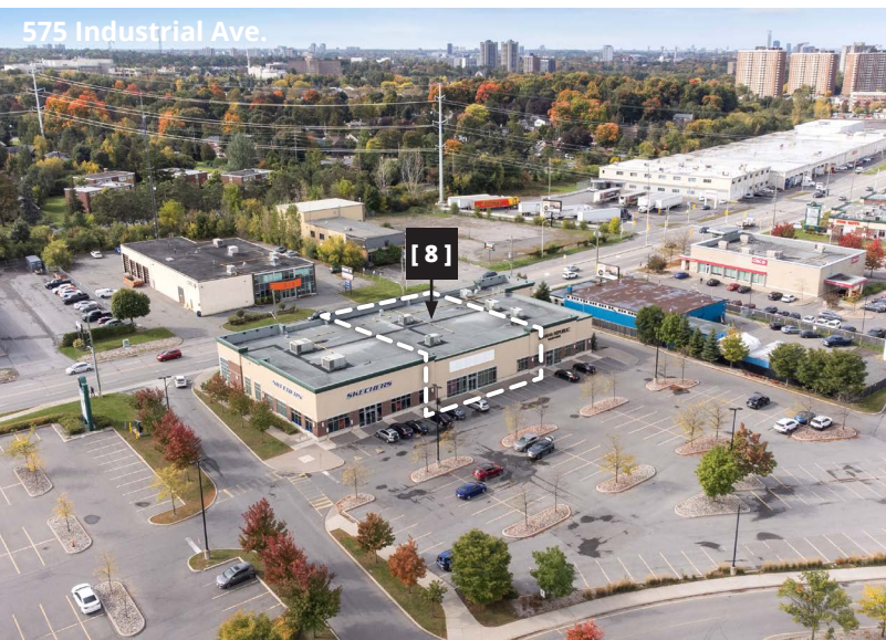
575 Industrial Ave.