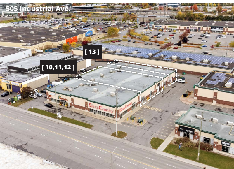
505 Industrial Ave.