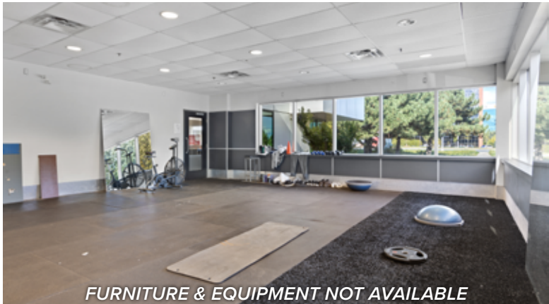
FURNITURE & EQUIPMENT NOT AVAILABLE