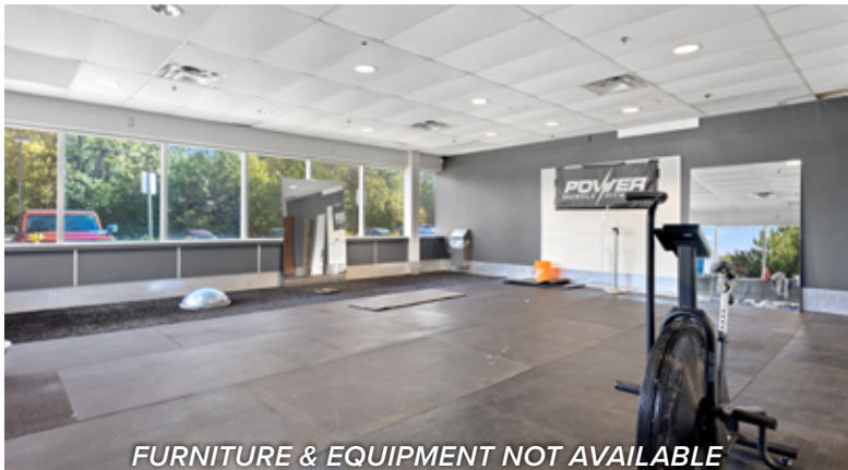
FURNITURE & EQUIPMENT NOT AVAILABLE