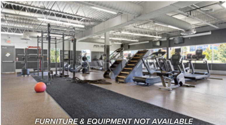
FURNITURE & EQUIPMENT NOT AVAILABLE