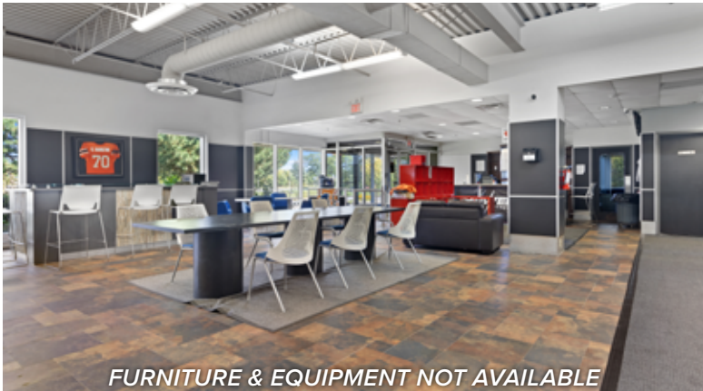
FURNITURE & EQUIPMENT NOT AVAILABLE