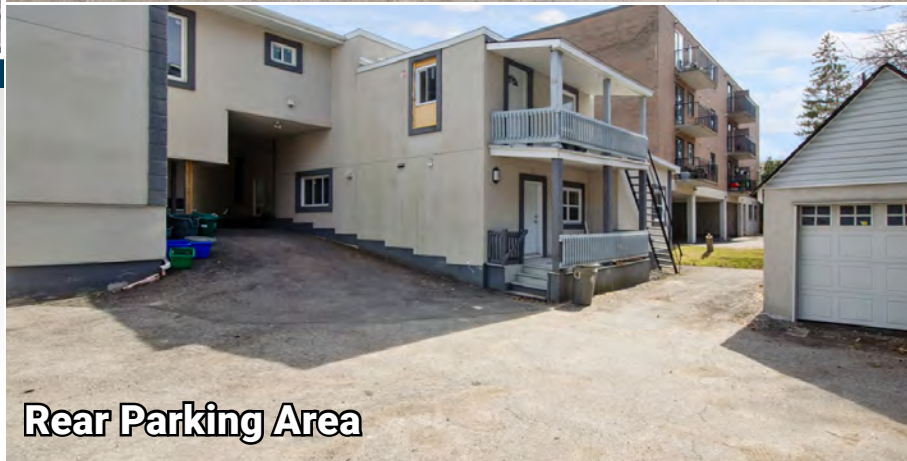
Rear Parking Area