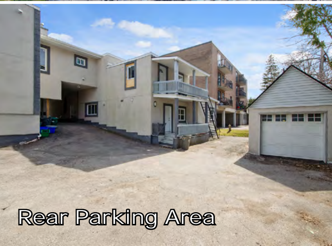
Rear Parking Area