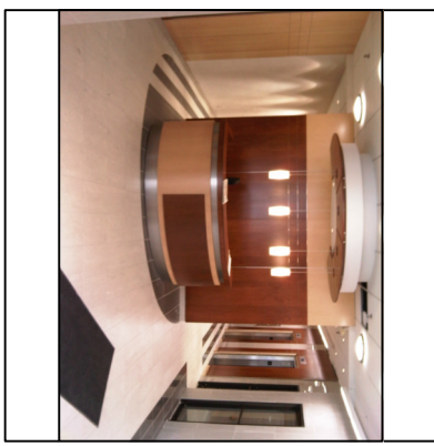
INTERIOR LOBBY VIEW