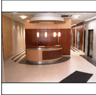
MAIN BUILDING LOBBY