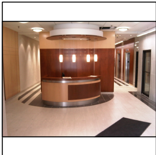
MAIN FLOOR LOBBY

PREPARED FOR: District Realty Corporation, Brokerage ADDRESS: 1 Nicholas Street, Ottawa, ON DATE: January 7, 2011 REVISION: n/a PROJECT NUMBER: 100202 DRAWING SIZE: 8.5" x 14" - Legal Size