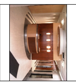
MAIN LOBBY VIEW