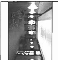
MAIN LOBBY VIEW