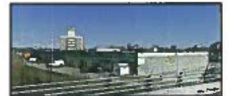
EXTERIOR VIEW FROM BRIDGE

PREPARED FOR: District Realty Corporation, Brokerage ADDRESS: 250 City Centre Avenue, Ottawa, ON DATE: December 31, 2010 REVISION: n/a PROJECT NUMBER: 100102 DRAWING SIZE: 8.5" x 14" - Legal Size