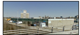
EXTERIOR VIEW FROM BRIDGE