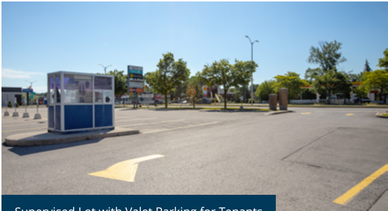
Supervised Lot with Valet Parking for Tenants