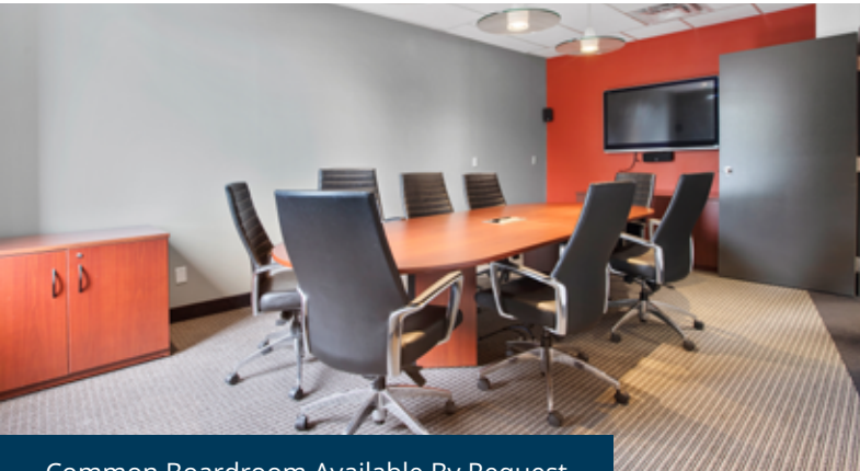
Common Boardroom Available By Request