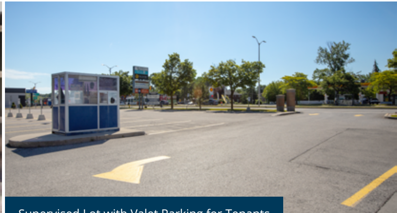
Supervised Lot with Valet Parking for Tenants