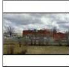
HWY 417 VIEW

PREPARED FOR: District Realty Corporation, Brokerage ADDRESS: 1417-C Cyrville Rd., Ottawa, ON DATE: October 13, 2010 REVISION: n/a PROJECT NUMBER: 100084 DRAWING SIZE: 8.5" x 11" - Legal Size