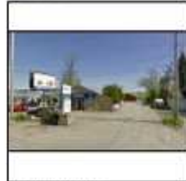
CYRVILLE RD. VIEW