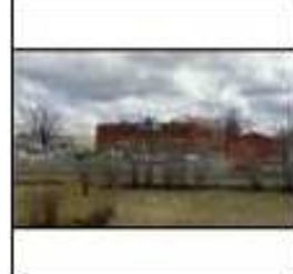
HWY 417 VIEW

PREPARED FOR: District Realty Corporation, Brokerage ADDRESS: 1417-C Cyrville Rd., Ottawa, ON DATE: October 13, 2010 REVISION: n/a PROJECT NUMBER: 100084 DRAWING SIZE: 8.5" x 11" - Legal Size