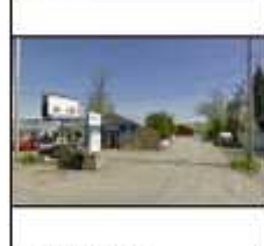
CYRVILLE RD. VIEW