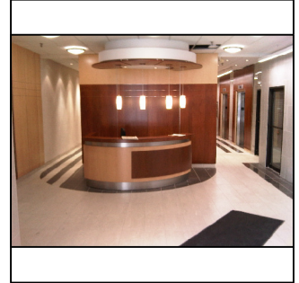
BUILDING LOBBY VIEW