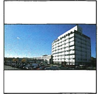
EAST & NORTH ELEVATIONS

FLOOR PLANS PREPARED BY: ECHOPROPERTIES.CA